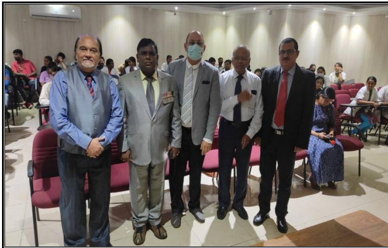
Kargil Vijay Diwas Celebration