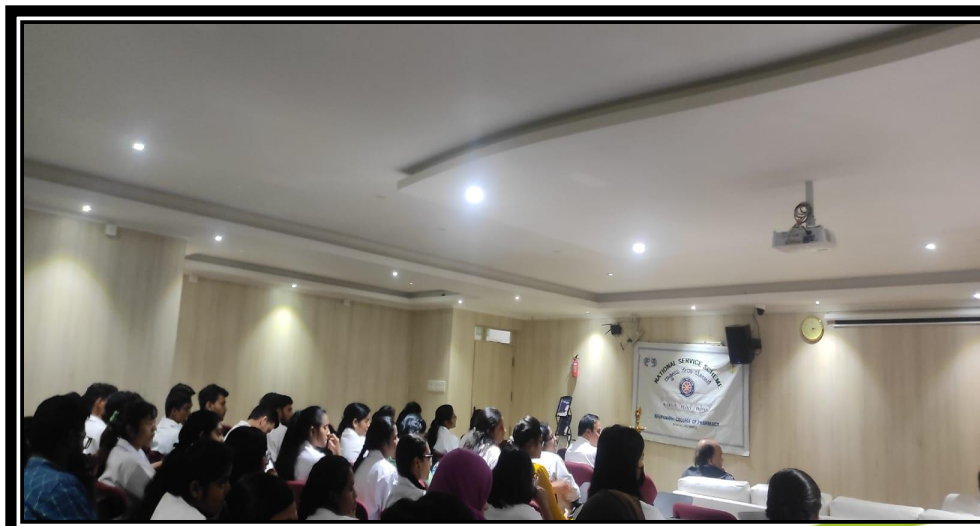
Kargil Vijay Diwas